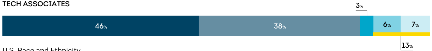
U.S. Race and Ethnicity

People who identify as: ■ White ■ Asian ■ Other categories ■ Black ■ Hispanic — People who identify as belonging to underrepresented groups